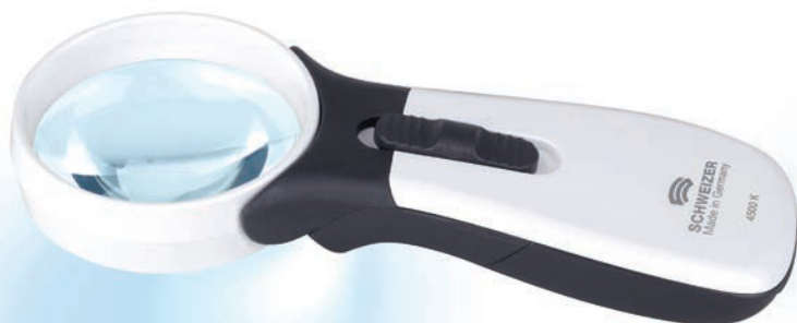
■ ERGO-Lux MP mobil