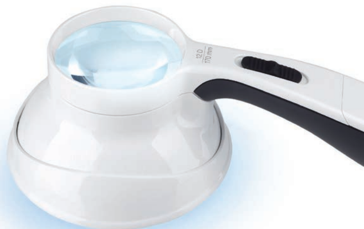
■ ERGO-Lux MP with ERGO-Base