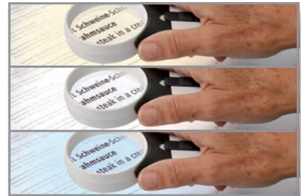
Even distribution of light in any situation – choice of 3 light temperatures.