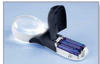
Easy battery replacement: open battery box by folding back the bottom shell of the handle.