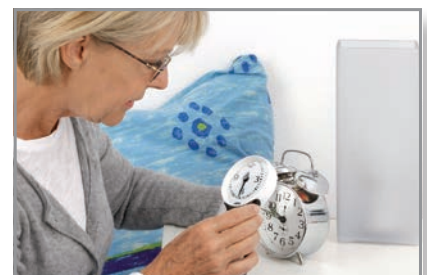
View finest details in a comfortable reading posture.