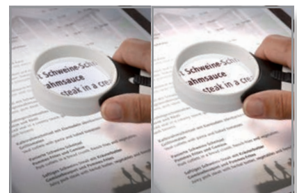
Extra bright lighting – the boost switch controls 2 brightness levels.